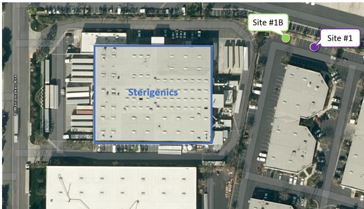
Figure 1 – Map of Monitoring Sites Near Sterigenics Ontario

South Coast AQMD staff collected 24-hour air monitoring samples adjacent to and nearby Sterigenics Ontario beginning on June 16, 2022, and found elevated levels of ethylene oxide at these sampling sites. Figure 1 below shows the locations of the samplers positioned near Sterigenics Ontario. As seen in Table 1 and Figure 2, the levels that have been recorded near Sterigenics Ontario are substantially higher than the 2021 annual average ethylene oxide concentration from the South Coast AQMD Rubidoux regional monitoring station, which is 0.06 ppbv (with a max value of 0.14 ppbv). 3 Over many years, these levels would present a cancer risk to off-site workers substantially higher than the Rule 1402 (c)(19) Significant Risk Level of 100 chances-in-one million. No additional sources of ethylene oxide near the monitored areas have been identified.