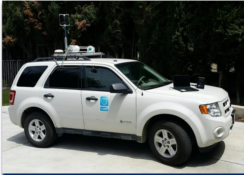
Figure 1. SCAQMD mobile platform for Exxon Mobil FCCU startup monitoring

More detailed results of the mobile measurements will be provided in a future update.