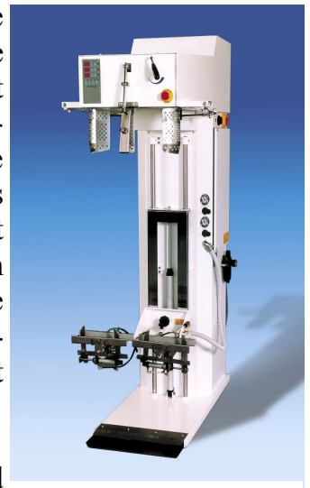
Tensioning Pants Topper

Wet cleaned garments can be finished using either conventional pressing equipment or specialized tensioning finishing equipment. Tensioning presses are designed to reverse or prevent shrinkage and/or seam crumbling and creasing of garments by applying widthwise and lengthwise tension on garments during the pressing process. Tensioning finishing equipment is increasingly recognized as an essential component of professional wet cleaning. Performance tests have shown that professional wet cleaning is effective in the actual cleaning of clothes, but that dimensional change (shrinking and stretching) can sometimes be a problem if the cleaner does not use tensioning equipment. In addition, tensioning finishing equipment has been shown to reduce the pressing labor time at professional wet cleaning facilities.