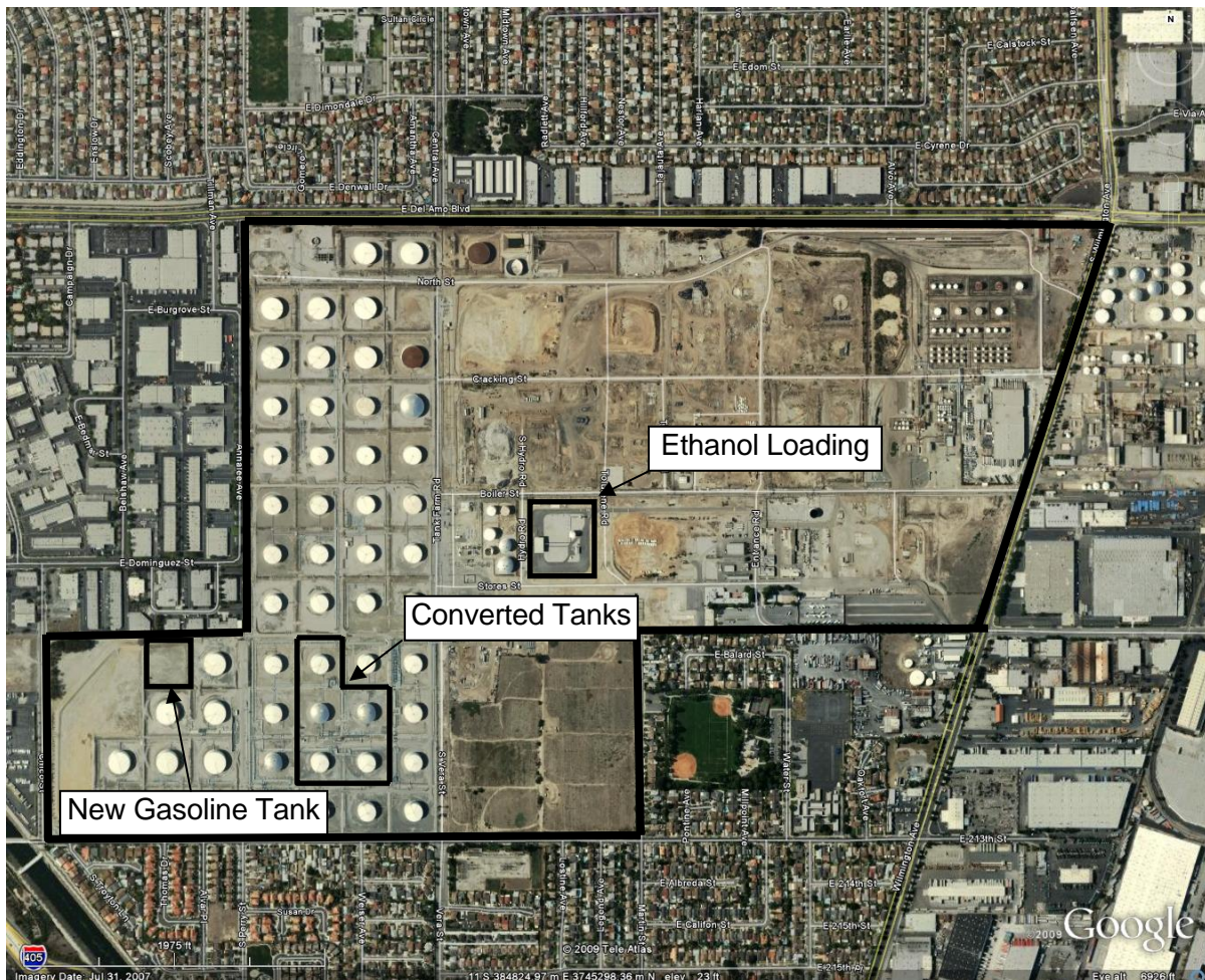
Figure 1-3. Site Plan Showing Locations of Project Components