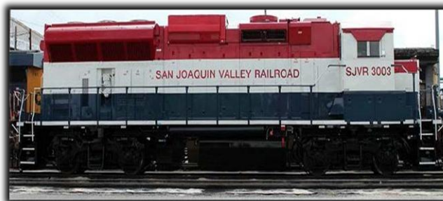
Tier 4 diesel-electric