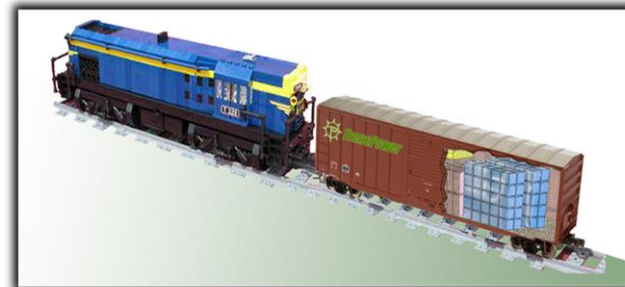
Fuel cell tender concept