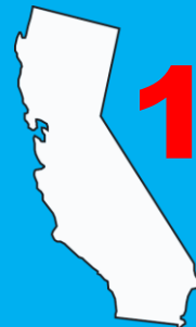
Average DERA Funding (FY08-FY16)