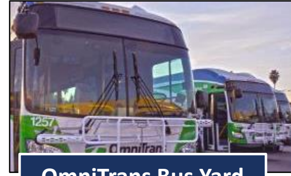
OmniTrans Bus Yard