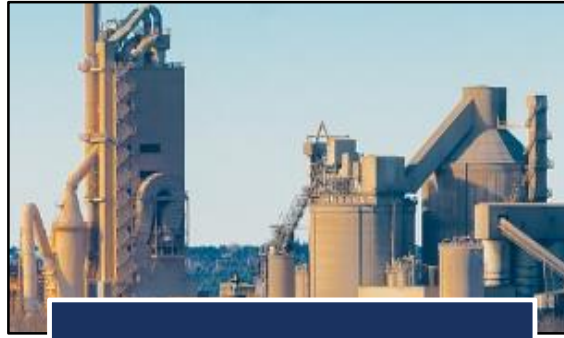
Concrete Batch Plants