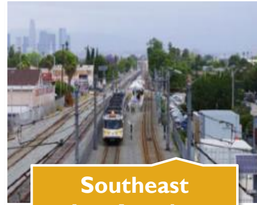
Southeast Los Angeles