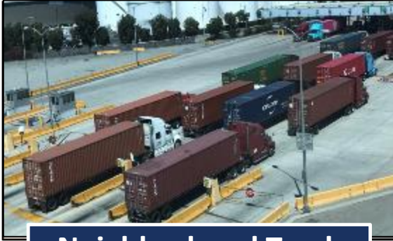
Neighborhood Truck Traffic