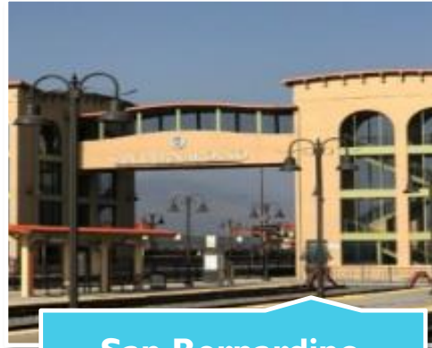
San Bernardino, Muscoy