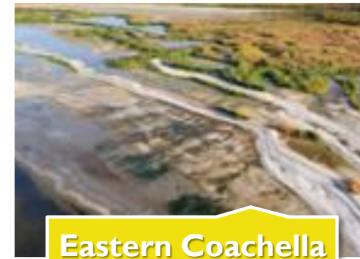
Eastern Coachella Valley