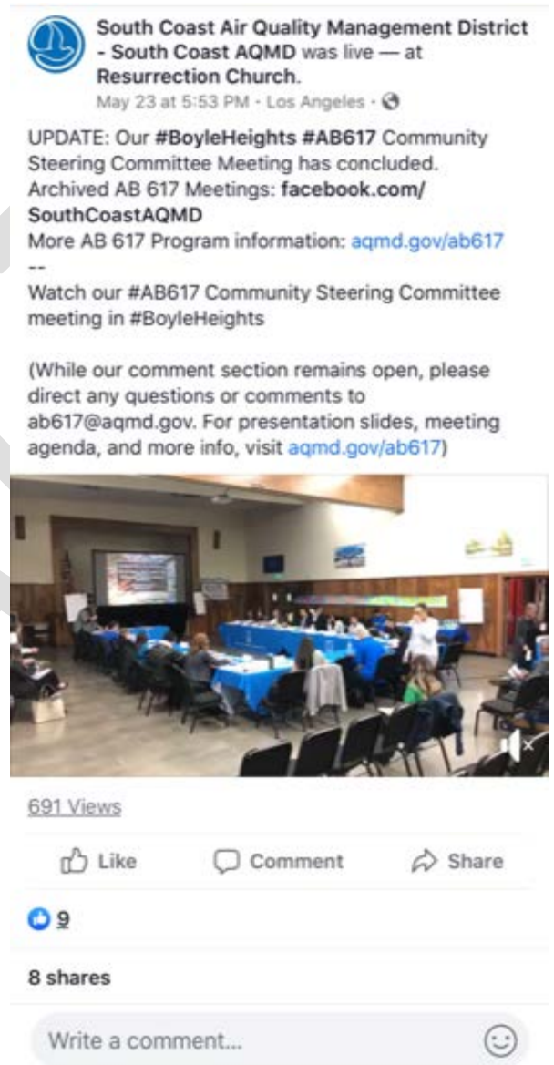
Figure 2-6. Screenshot of Facebook Live recording of a CSC meeting in Boyle Heights

http://www.aqmd.gov/nav/about/initiatives/environmental-justice/ab617-134/east-la