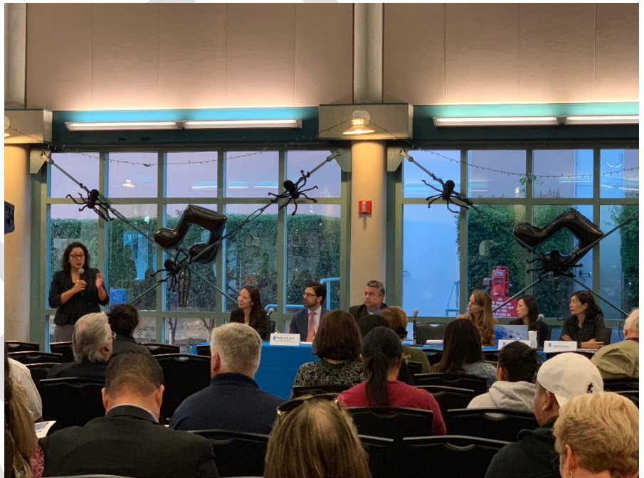
Figure 2-2. Community kick-off meeting at the Commerce Senior Center

16, 2018 at the Commerce Senior Center (Figure 2-2). Approximately 60 people attended the meeting. In addition to receiving information about AB 617, attendees were invited to visit a variety of booths, which provided information about some existing South Coast AQMD programs, community monitoring, community air measurement efforts, and incentive programs.