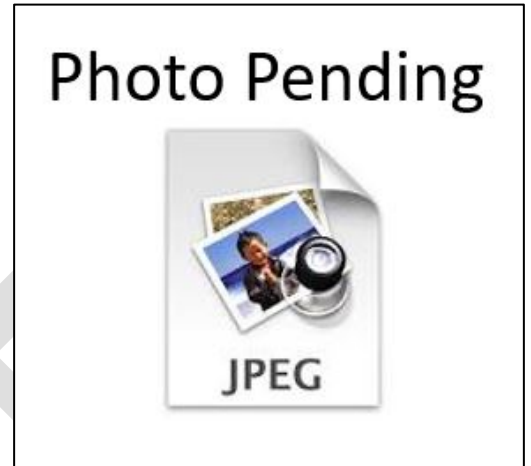
Figure 2-3. Community Steering Committee meeting in Commerce

http://www.aqmd.gov/docs/default-source/ab-617-ab-134/steering-committees/east-la/roster-with-bios.pdf?sfvrsn=29 .