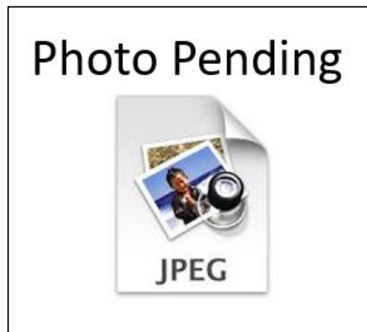
Figure 2-4. Community Steering Committee meeting in ELABHWC