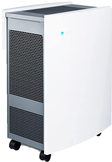
Blueair Classic 680i Air Purifier