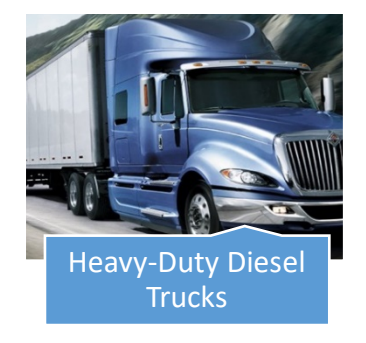
Figure 5b-1: Examples of Mobile Sources