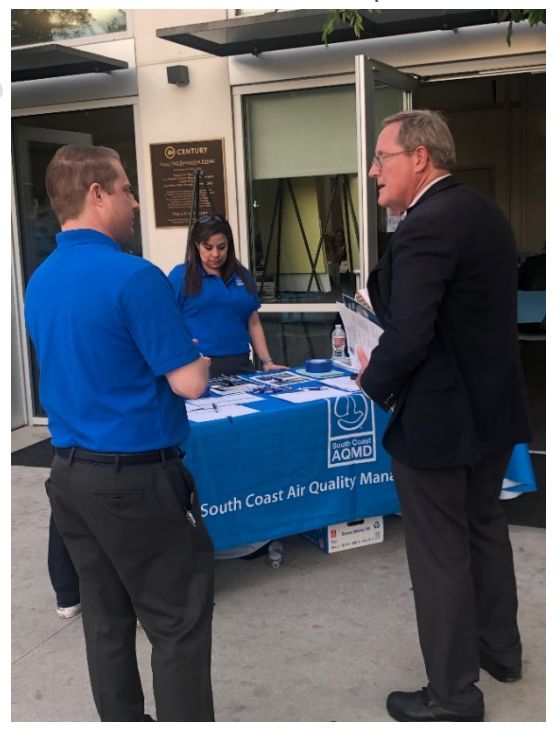
Figure 2-1. Community liaisons assisting CSC members of the public

A Community Liaison from the South Coast AQMD was designated for the Wilmington, Carson, and West Long Beach community. The Community Liaison served as the point of contact to communicate with members of the CSC and members of the public to address any concerns regarding logistics and implementation of the CERP and Community Air Monitoring Plan (CAMP) (Figure 2-1). Community Liaisons ensure communication throughout the process of designing and implementing the Program and to work with community members to identify the best ways to make information accessible and userfriendly. The South Coast AQMD Community Liaison this community is Ryan Stromar (rstromar@agmd.gov). In addition, Nicole Silva (nsilva@agmd.gov) and Dianne Sanchez