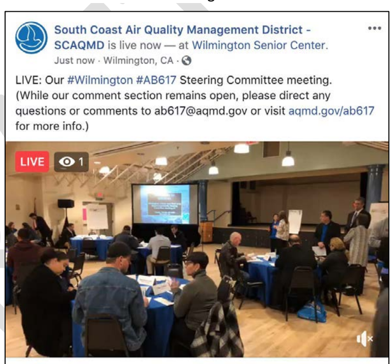
Figure 2-4. Screen shot of Facebook Live recording in Wilmington

Staff received a suggestion from one CSC member to live-stream meetings on social media in order to engage youth who use this technology, and who may not be able to attend the meetings in person. All CSC meetings were subsequently live-streamed using Facebook Live shown in Figure 2-5. The links to the live-stream recording were also posted on the community webpage, so that members who could not attend or view the meeting live could view the recorded video of the meeting. Each video received approximately more than 100 views.