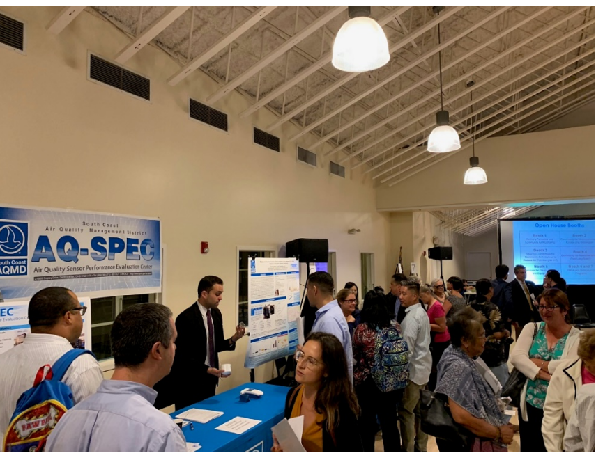
Figure 2-2. Community kick-off meeting in Wilmington

held on Tuesday October 2, 2018 at the Wilmington Senior Center (Figure 2-2). Approximately 120 people attended the meeting. In addition to information about AB 617, attendees were invited to visit a variety of information booths, which provided information about some existing South Coast AQMD programs, including refinery fenceline and community monitoring, community measurement efforts, and incentive programs. Staff from Aclima, Inc.