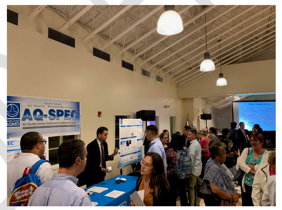
programs, including refinery Figure 2-2. Community kick-off meeting in Wilmington

monitoring, community air measurement efforts, and incentive programs. Staff from Aclima, Inc. (www.aclima.io, a technology company that is conducting air monitoring in the community), as well as representatives from the local YMCA and Rotary Club, also provided information at the kick-off meeting booths.