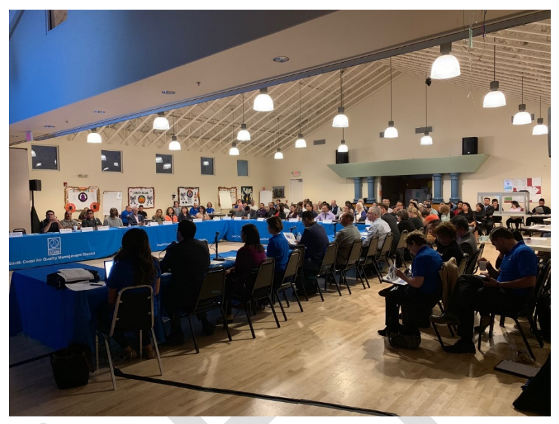
Figure 2-3. Community Steering Committee meeting in Wilmington

CSC membership is comprised of stakeholders with community knowledge to help drive community action. The CSC creates a way to incorporate community expertise and direction in the development and implementation of clean air