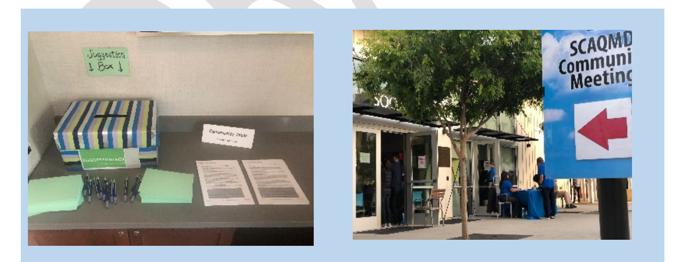
Figure 2-10. Suggestion box and signs for a CSC meeting in West Long Beach

Broader public engagement is also important to the AB 617 program. Suggestion boxes provided at the CSC meetings allows CSC members, as well as the general public, to provide input and suggestions on the AB 617 process (Figure 2-10). Staff reviews the comments after each CSC meeting, and responds as needed. Anonymous submissions are accepted. In addition, a Community Affairs Table at the CSC meetings provides a space for community members to share flyers and handouts about events and programs happening in the community.