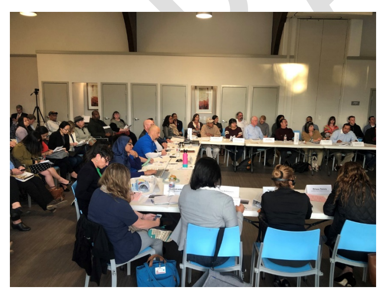
Figure 2-4. Community Steering Committee meeting in West Long Beach

programs in each community. Staff will continue to seek recommendations and feedback from the CSC as the CERP is being implemented, and adjust the outreach approaches as needed to be even more effective.