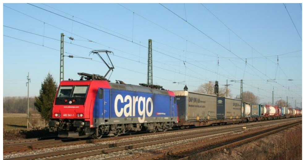
Figure 6 European Electric Freight Locomotive

Fixed guideway systems, as the name implies, are mechanisms that move the containers on rails, magnetic levitation tracks, or other fixed structures. An example of a fixed guideway zero-emission container movement system in use today is an electric locomotive pulling a train of containers. Such electric locomotives receive power from overhead catenaries or electric third rails, and are used for freight transport in Europe, Asia and other locations, but not in the United States. Figure 6 shows an electric freight locomotive in Europe.