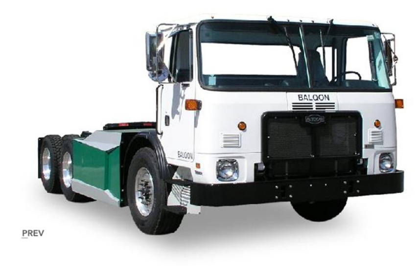
Figure 1Balqon Electric Battery Truck