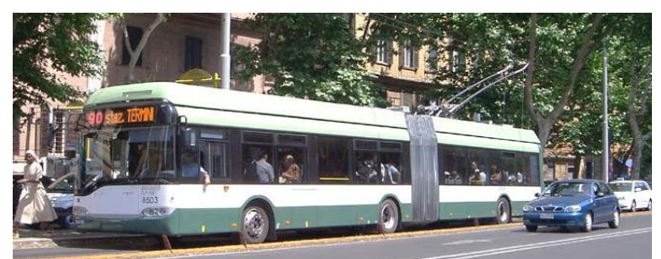
Figure 4 Dual-Mode Battery Electric Transit Bus (Rome)

bus operates on the wired roadways. Figure 4 shows a dual-mode electric and batteryelectric transit bus with detachable catenary connection in Rome, Italy.<sup>5</sup>