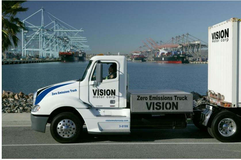
Figure 2Vision Zero-Emission Fuel Cell Battery Electric Truck

The discussions above regarding number of vehicles needed, operational issues and implementation mechanisms are generally applicable to fuel cell trucks, although hydrogen fueling time would be less than Balqon truck charging time, and would be similar to fueling time for current LNG trucks. (TIAX, 17). Per vehicle combined capital and operating costs, as well as fueling infrastructure costs, are projected by TIAX to be higher than for the Balqon truck, although costs could be below the TIAX projections if certain cost reductions expected by Vision are realized, and if cost of fueling infrastructure is recovered through revenue sales. (TIAX, 12, 15). In addition, as noted above, Vision does have a private purchaser with a potential sale of at least 100 units.