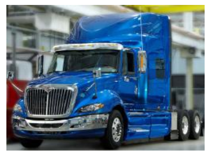
Figure 3: Dual-Mode Hybrid (Meritor)

The discussions above regarding number of vehicles needed, operational issues and implementation mechanisms are generally applicable to hybrid AER trucks. Costs for commercially available units are unknown at this time, but would likely be slightly more than conventional hybrids as larger battery packs would be needed for the electric only mode. The incremental cost of a hybrid AER truck compared to a diesel truck is anticipated to be approximately $50,000-70,000 depending on the capacity of the battery pack. This incremental cost is similar for LNG trucks which were successfully funded through a combination of grants for the Ports' Clean Truck Program (see below).