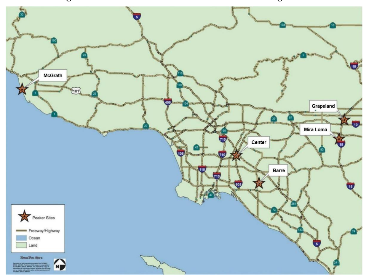
Figure 4-1: Location of SCE's Five Generation Peaking Plants

On August 15, 2006, the California Public Utilities Commission (CPUC) issued an Assigned Commissioner's Ruling (ACR) addressing electric reliability needs in Southern California for the summer of 2007 and beyond. The August 15, 2006 ACR included a reference to the CAISO's August 9, 2006 letter to the CPUC that urged the CPUC to direct the state's investor-owned utilities to solicit a combination of quick-start generation and demand response opportunities that could be developed quickly (less than a year) to increase available electrical supply at the peak hours and to enhance grid reliability. To implement this directive, SCE took steps to install five separate peaking generator projects either within or near existing substations at five strategic locations around Southern California. Figure 4-1 shows the relative locations of the five facilities, all of which were constructed and are operating as mandated by the CPUC. The Barre Peaker is one of the five generation peaking facilities developed by SCE.