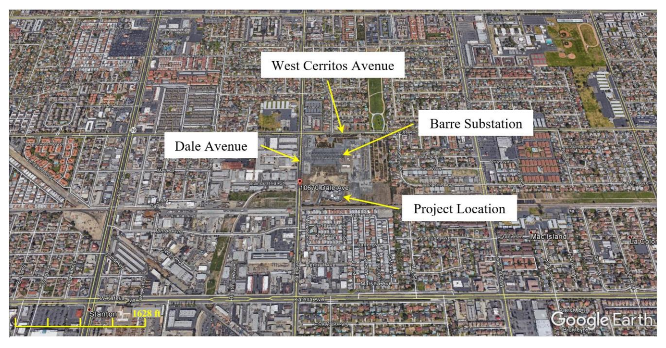
Figure 3-2: Aerial Photographs of the Existing Barre Generation Peaking Facility