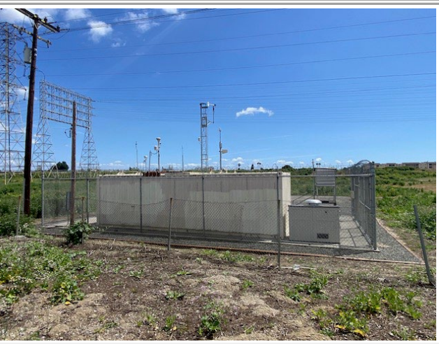
Looking at the probe from the West.