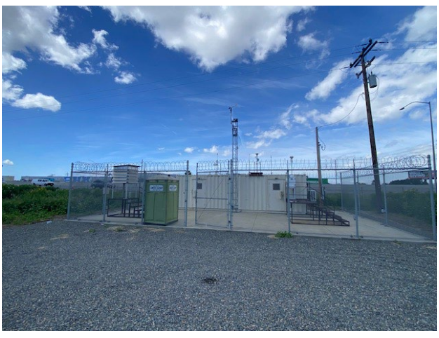
Looking at the probe from the East.