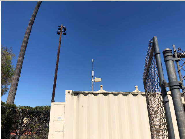
Looking at the probe from the South.