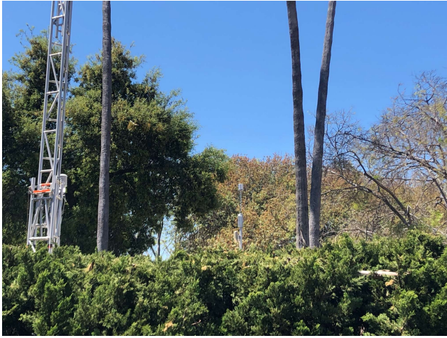
Looking at the probe from the North.