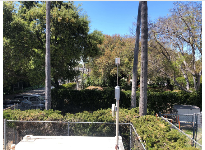
Looking West from the probe.