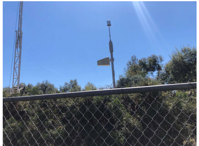
Looking at the probe from the East.