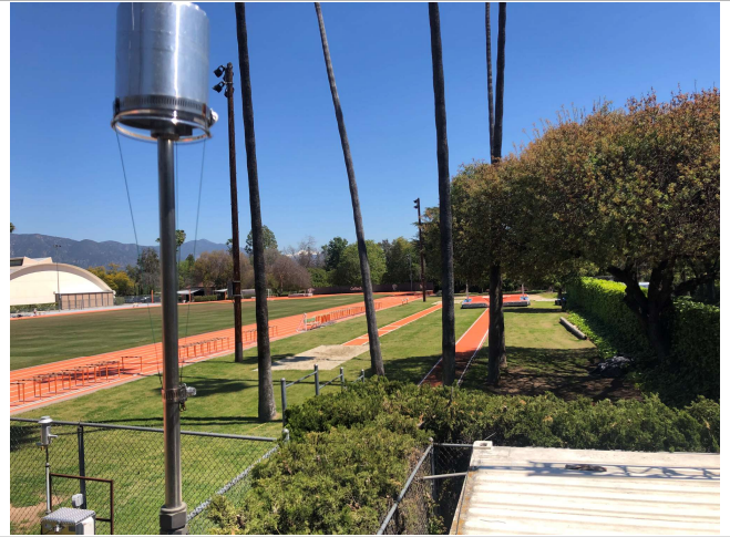
Looking East from the probe.