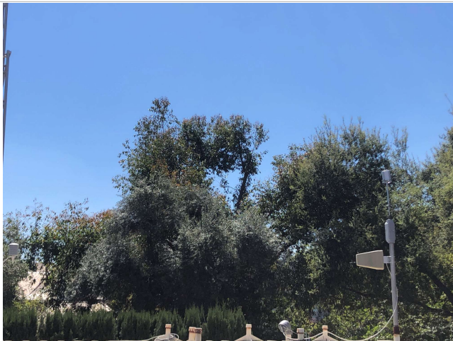
Looking South from the probe.