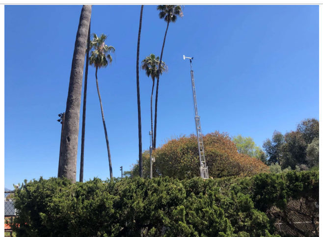
Looking at the probe from the West.