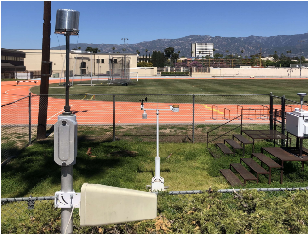
Looking North from the probe.