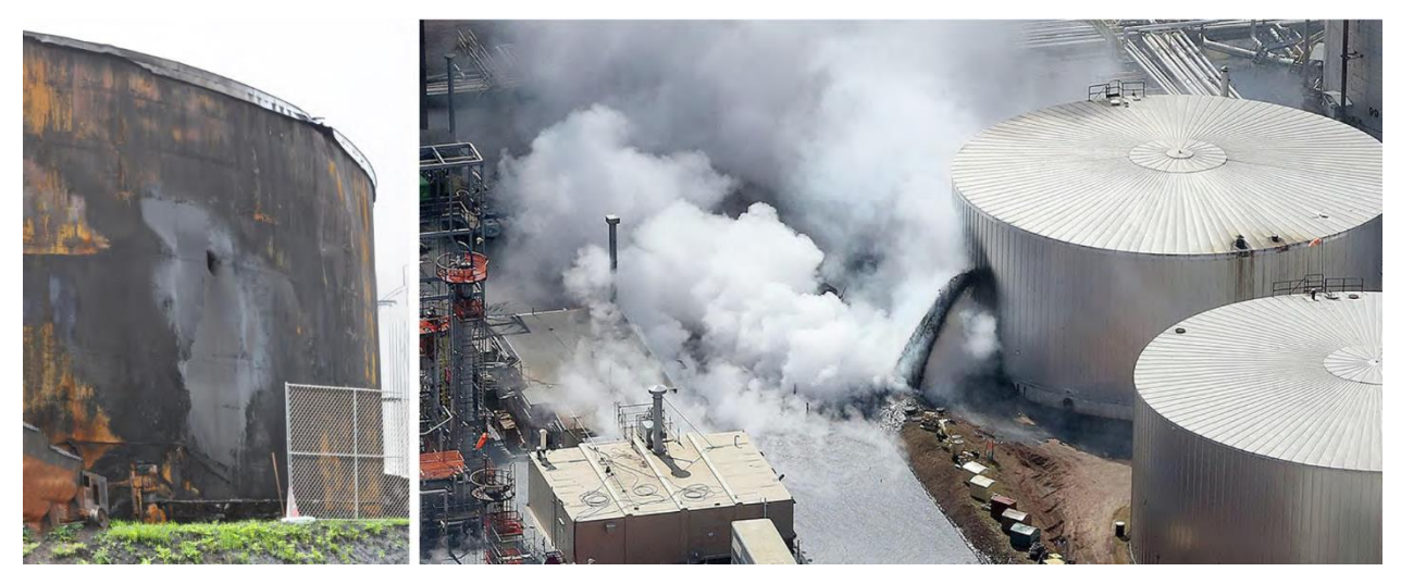
Figure 5 — Enormous hole several feet in diameter in an asphalt storage tank resulting from the April 26, 2018 Husky Superior Refinery Explosion in Superior, Wisconsin.