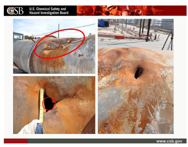
Figure 4 — Rupture of tank resulting from February 18, 2015 explosion at the Torrance refinery. The rupture shown in the lower-left image has the same flow area as a 3.65-inch-diameter hole , which has over 13 times the flow area of a 1-inch-diameter hole.

Release Scenario II: The rupture of the refinery's HF Containment System that releases the entire amount of HF from any of its HF Containment Subsystems from the break of any size pipe in the subsystem. The thermodynamic state of the released HF is the worst case (highest temperature and pressure, lowest additive) that exists in the subsystem. The velocity of the release is set by the pressure. The rupture location is any pipe, with no attempt to discern which is more likely. A break in every pipe of every subsystem shall be analyzed. All paths for HF to go airborne, as noted above, shall be evaluated.