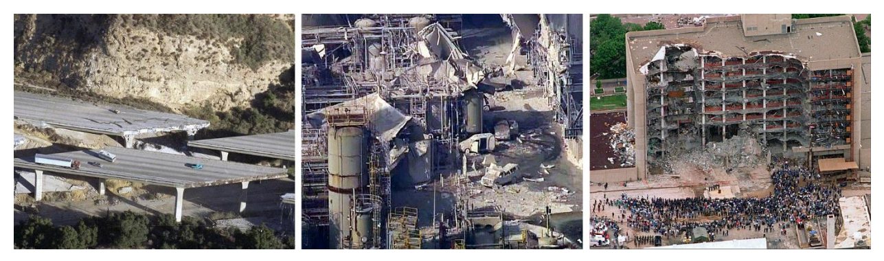
Figure 3 — Calamitous Events: <u>Earthquakes, Accidents, and Terrorism (EAT). Left-to-Right: 1) The magnitude 6.7 Northridge Earthquake on January 17, 1994, 2) Torrance refinery explosion on February 18, 2015, 3) Alfred P. Murrah Federal Building after the Oklahoma City truck-bomb explosion on April 19, 1995.</u>

The Valero and PBF's Torrance Refining Company, as well as the SCAQMD Staff, have defined release scenarios in terms of a rupture hole size (see page 11of the June 22 Staff Presentation — Staff Recommendations for Release or Hole Size ). Alarmingly, they assert that only very small piping can break (Refineries: 1-inch hole, SCAQMD Staff: 1-to-2 inch hole). Their preposterous assertion not only defies common sense (see Figure 3 ) given calamitous events such as earthquakes<sup>*</sup>, terrorism, operator errors, and the terrible history of refinery explosions, which in more than one instance have hurled massive objects at high velocities, but also flies in the face of an actual major HF release, where a 2-inch and a 4-inch pipe simultaneously broke off an HF tank (see third example, above).