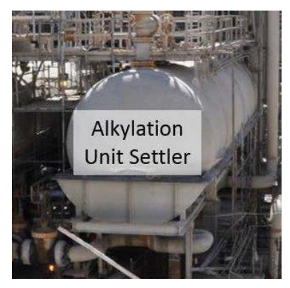
Figure 2 — 18-inch pipe diameter is scaled from the image of 13-foot-diameter acid settler tank at the Torrance Refinery.

Second, consider <u>the release of 84,000 pounds of sulfuric acid over</u> <u>two-and-a-half hours from an alkylation-unit settler tank at the Tesoro</u> <u>Refinery in Martinez, California</u>, on February 12, 2014. The release was onto the refinery grounds and into a process sewer system. Because the refinery used vastly safer sulfuric acid in its alkylation process, there was no vapor cloud or offsite consequences to the community. The release was the result of a failure in the coupling of a