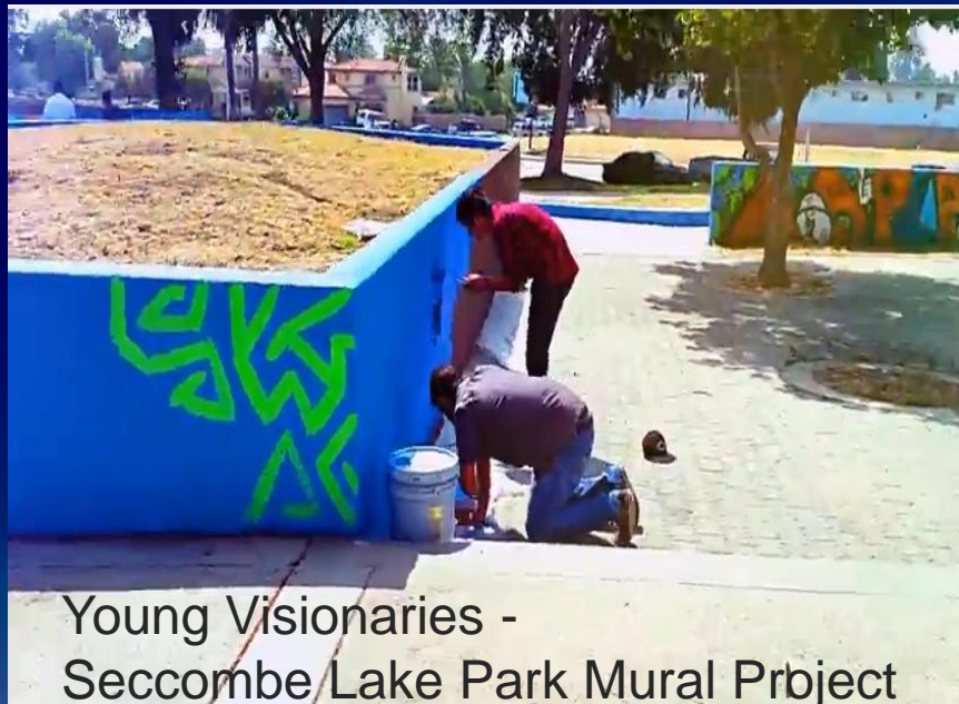
Young Visionaries - Seccombe Lake Park Mural Project