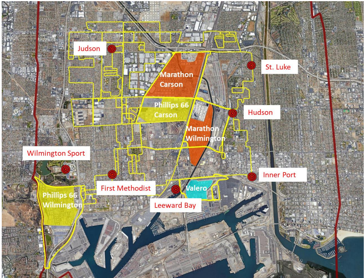
Figure 1. Map showing mobile monitoring routes taken by the South Coast AQMD mobile platform (yellow lines) in the WCWLB community between June 2019 and February 2020. The shaded areas show the five major petroleum refineries, and red circles refer to the locations of the Rule 1180 Community Air Monitoring Stations