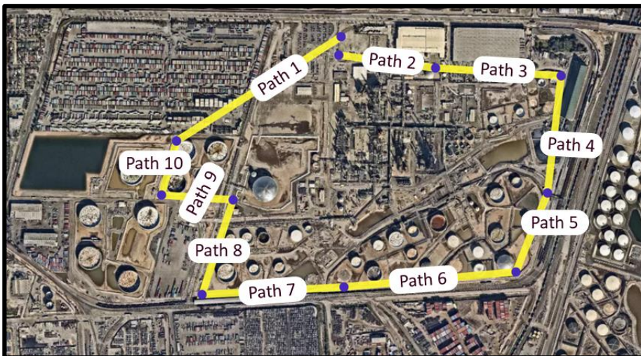
Map of the fence line air monitoring at Phillips 66 Carson refinery, where air quality is continuously monitored along the light paths around the refinery

Naturally, every gas in the air can absorb a set of light wavelengths. This set is unique and serves as a fingerprint that allows to explicitly identify it. ORS systems work by projecting a beam of light to the open air and receiving it at a detector. If a gas is present in the path, part of the beam light is absorbed. By comparing known reference standards of light absorption by gases with the results from field measurements, the system can identify the gas and quantify the average gas concentration in the path between the source projector and the detector.