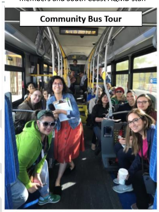
Figure 2-8: Community Bus Tour - CSC members and South Coast AQMD staff

Committee members were also invited to give presentations during CSC meetings to share information about the work they are doing in the community that is complementary to the actions being developed in the CERP, such as programs implemented by their organization that address air quality issues in the community.