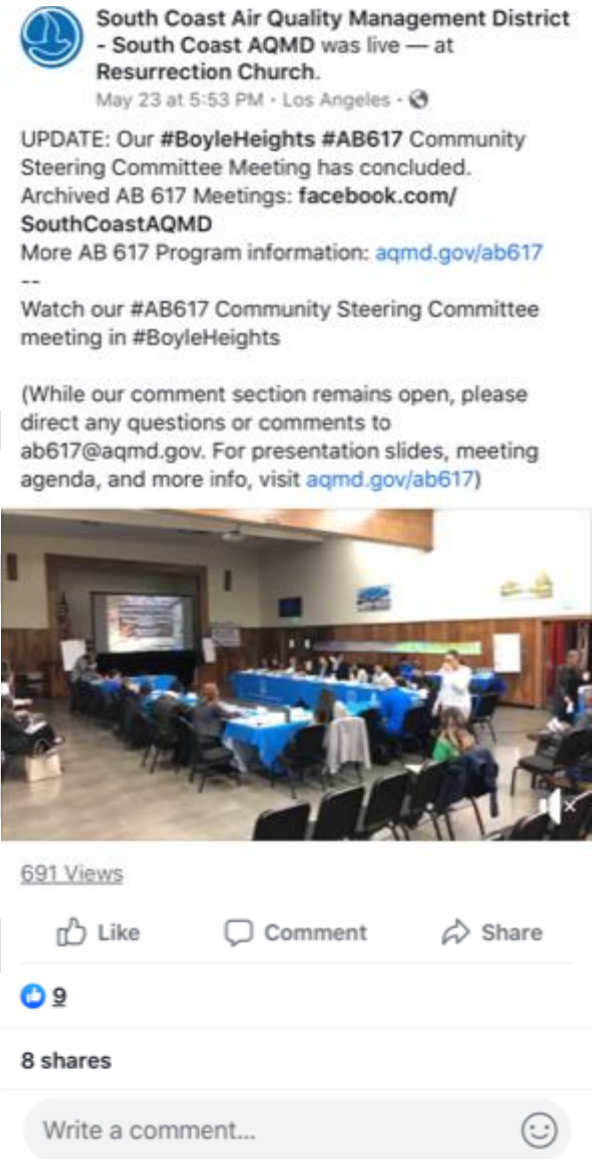
Figure 2-5: Screenshot of Facebook Live recording of a CSC meeting in Boyle Heights

Staff received a suggestion from one CSC member to live-stream meetings on social media in order to engage youth who use this technology and who may not be able to attend the meetings in person. All CSC meetings were subsequently live-streamed using Facebook Live shown in Figure 2-5. The links to the live-stream recording were also posted on the community webpage, so that members who could not attend or view the meeting live could view the recorded video of the meeting. Each video received approximately 100 views.