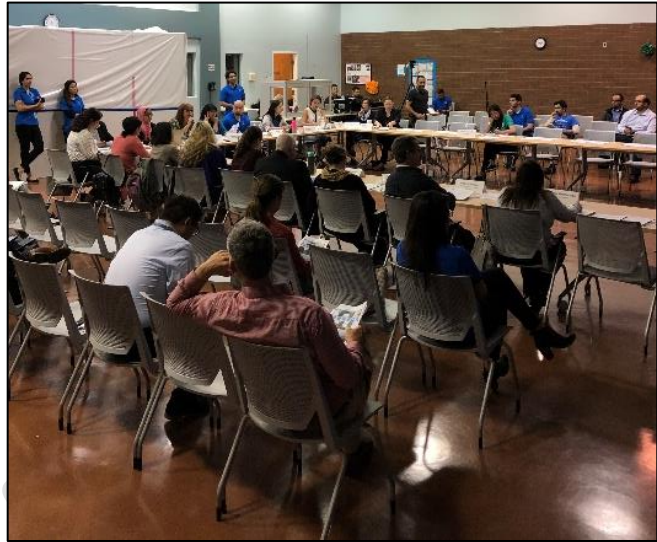
Figure 2-3: Community Steering Committee meeting in East Los Angeles

http://www.aqmd.gov/docs/default-source/ab-617-ab-134/steering-committees/east-la/roster-with-bios.pdf?sfvrsn=29.