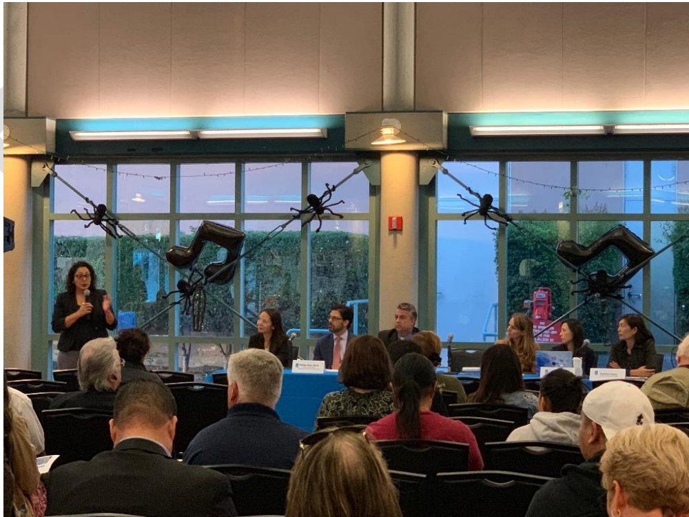
Figure 2-2: Community kick-off meeting at the Commerce Senior Center

The Community Kick-Off Meeting in the ELABHWC community was held on Tuesday, October 16, 2018 at the Commerce Senior Center (Figure 2-2). Approximately 60 people attended the meeting. In addition to receiving information about AB 617, attendees were invited to visit a variety of booths, which provided information about some existing South Coast AQMD programs, community monitoring, community air measurement efforts, and incentive programs.