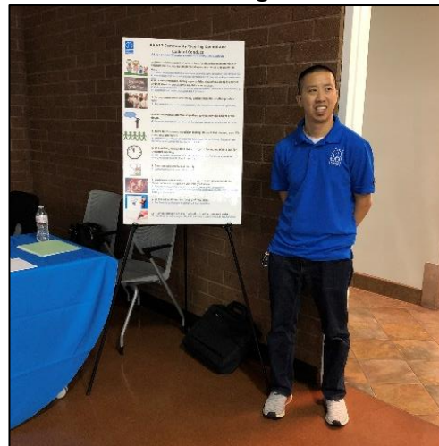
Figure 2-1: South Coast AQMD staff at a CSC meeting in East LA