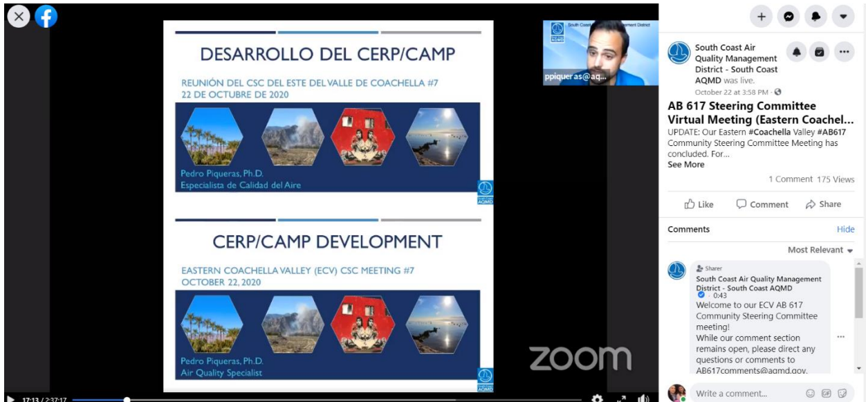
Figure 2-2. – Screen shot of community AB 617 webpage created for ECV