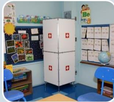
Air Filtration Systems