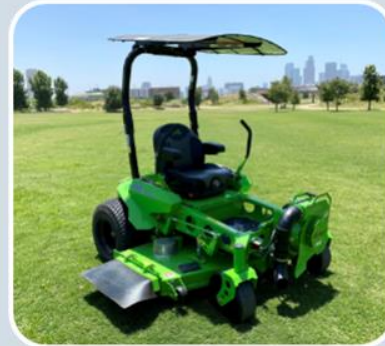
Zero- emission lawn & garden for schools