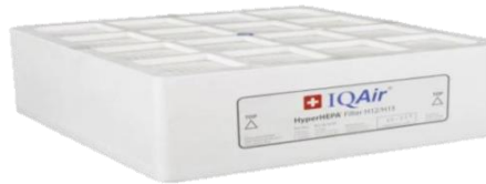
Air Filtration and Purifier Systems