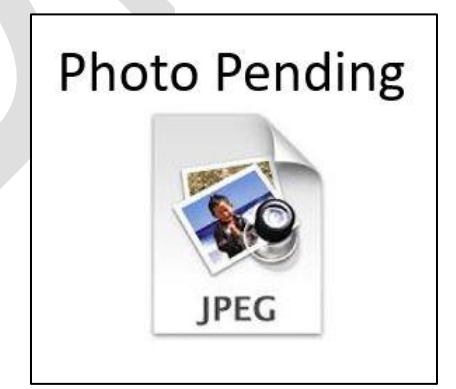
Figure 2-4. Community Steering Committee meeting in Muscoy

http://www.aqmd.gov/docs/default-source/ab-617-ab-134/steering-committees/sanbernardino/roster-with-bios.pdf?sfvrsn=8.