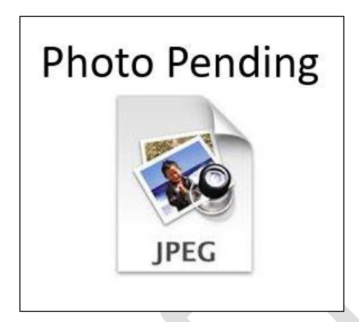
Figure 2-12. Small group meeting in San Bernardino with some CSC members and South Coast AQMD staff