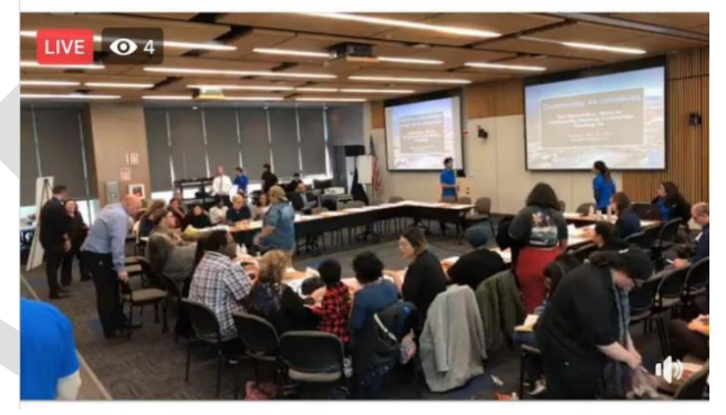
Figure 2-6. Screen shot of Facebook Live recording in San Bernardino

(While our comment section remains open, please direct any questions or comments to ab617@aqmd.gov. For presentation slides, meeting agenda, and more info, visit agmd.gov/ab617)