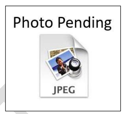
Figure 2-3. Mary Valdemar (San Bernardino Valley College), presenting outreach materials at the Community Steering Committee meeting in San Bernardino

CSC membership is comprised of stakeholders with community knowledge to help drive community action. The CSC creates a way to incorporate community expertise and direction in the development and implementation of clean air programs in each community. Staff will continue to seek recommendations and feedback from the CSC as the CERP is being implemented, and adjust the outreach approaches as needed to be even more effective.