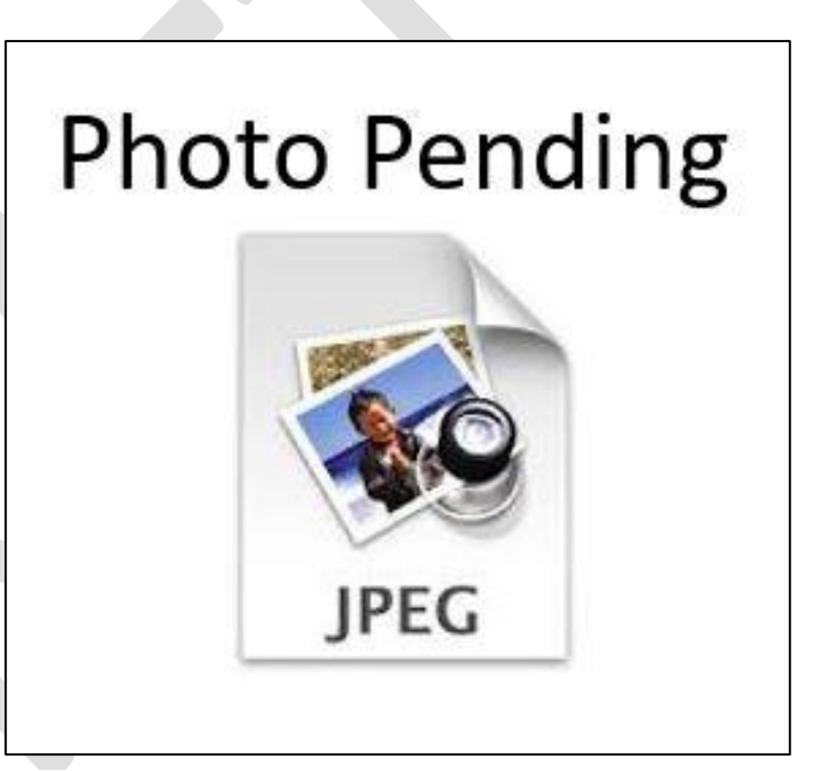
Figure 2-2. Community kick-off meeting at Ruben Campos Community Center, San Bernardino

The Community Kick-Off Meeting in the San Bernardino and Muscoy community was held on Tuesday October 9, 2018 at the Ruben Campos Community Center (Figure 2-2). Approximately 60 people attended the meeting. In addition to receiving information about AB 617, attendees were invited to visit a variety of booths, which provided information about some existing South Coast AQMD programs, community monitoring, community air measurement efforts, and incentive programs.