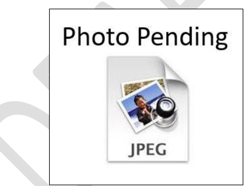
Figure 2-13. Small group meeting in San Bernardino with some CSC members and South Coast AQMD staff

Figure 2-12. Small group meeting in San Bernardino with some CSC members and South Coast AQMD staff