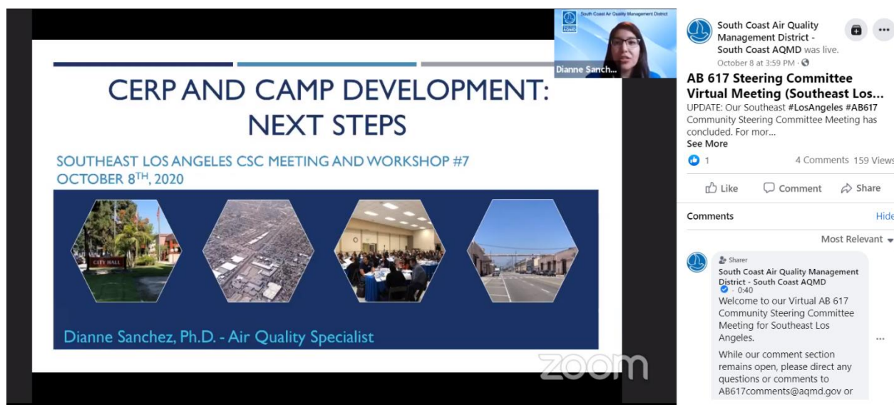
Figure 2-1: Facebook Live Screen Shot of a SELA CSC Meeting