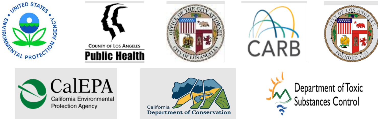
Figure 4-2: Examples of agencies that routinely collaborate with South Coast AQMD and CARB

CARB and South Coast AQMD are committed to working with other agencies on joint initiatives that will directly result in cleaner air. The combined resources, expertise, and legal authorities of different agencies can create a well-rounded approach to the regulatory process that leverages their respective strengths to address issues that cumulatively impact public health. For example, the Los Angeles City Attorney's Office partnered with South Coast AQMD to conduct inspections at specific facilities, including auto-body shops, in the City of Los Angeles.