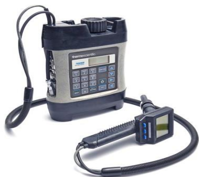
Figure 4-1: Portable instruments used by South Coast AQMD inspectors in the field

Toxic Vapor Analyzers (TVA): Inspectors can use TVAs to measure the level of certain gases in a specific area. This includes methane and volatile organic compounds (VOCs), which are emitted by petroleum sources and other types of sources.