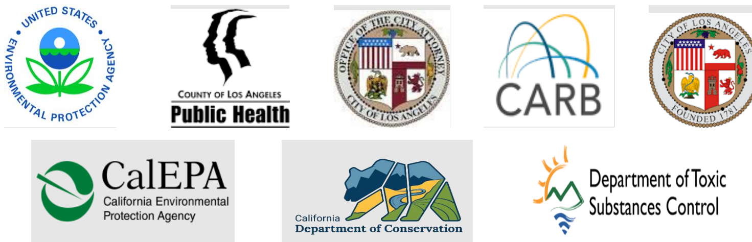
Figure 4-2: Examples of agencies that routinely collaborate with South Coast AQMD and CARB

CARB partners with local agencies to create memoranda of understanding (MOUs), such as an agreement with South Coast AQMD to enforce CARB’s greenhouse gas standards at certain types of facilities. In addition, CARB has already established partnerships with California DMV working on implementing registration holds for non-compliant trucks and buses, California Highway Patrol (CHP) to conduct roadside inspections, and other state and regional agencies to ensure the agencies are supporting each other’s enforcement efforts. Both South Coast AQMD and CARB have experience working in close collaboration with other regulatory agencies, cities and counties, public health agencies, and local police and fire departments to conduct investigations and provide public information about local air pollution sources.