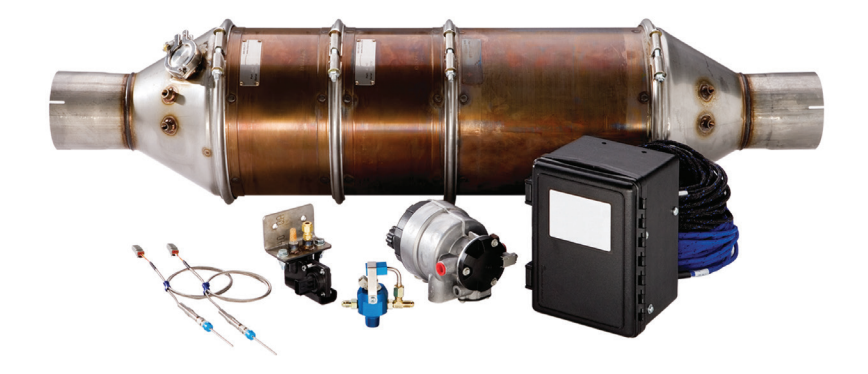
Use only CARB-verified soot filters!

Selecting and installing the right CARB-verified diesel particulate filter (DPF), also known as a soot filter, for your truck takes time. If your filter is not installed by January 1st of the applicable compliance year, or ordered four months prior to the deadline, then you may be in violation. Visit <a href="https://www.arb.ca.gov/truckstop">www.arb.ca.gov/truckstop</a> and click on "Engine Filters" for details.