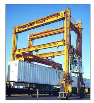
Rubber-Tired Gantry Crane

The California Air Resources Board (ARB) has in place a regulation, which took effect in 2006, to reduce emissions from mobile cargo handling equipment (CHE) operating at California's ports and intermodal rail yards. The regulation requirements, which are in section 2479 of title 13 of the California Code of Regulations, are applicable to all diesel-fueled equipment used at a California port or intermodal rail yard to lift or move containers, bulk or liquid cargo, or to perform routine or predictable maintenance and repair activities. Equipment at low-throughput ports meeting certain criteria are exempted.