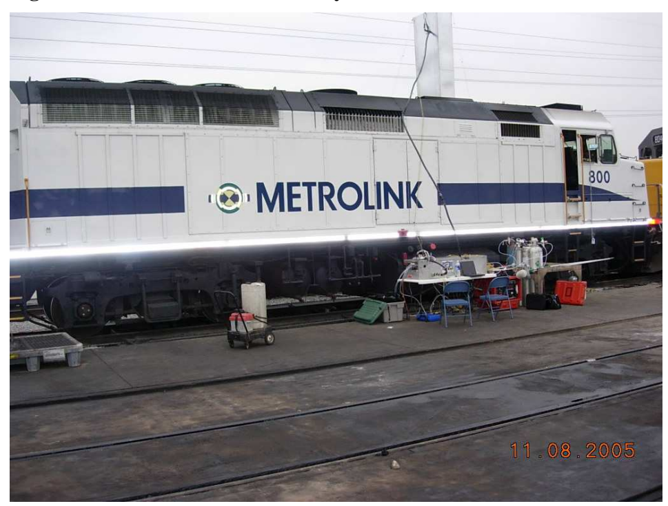
Figure 2: Emission measurement system installation on Metrolink No. 800