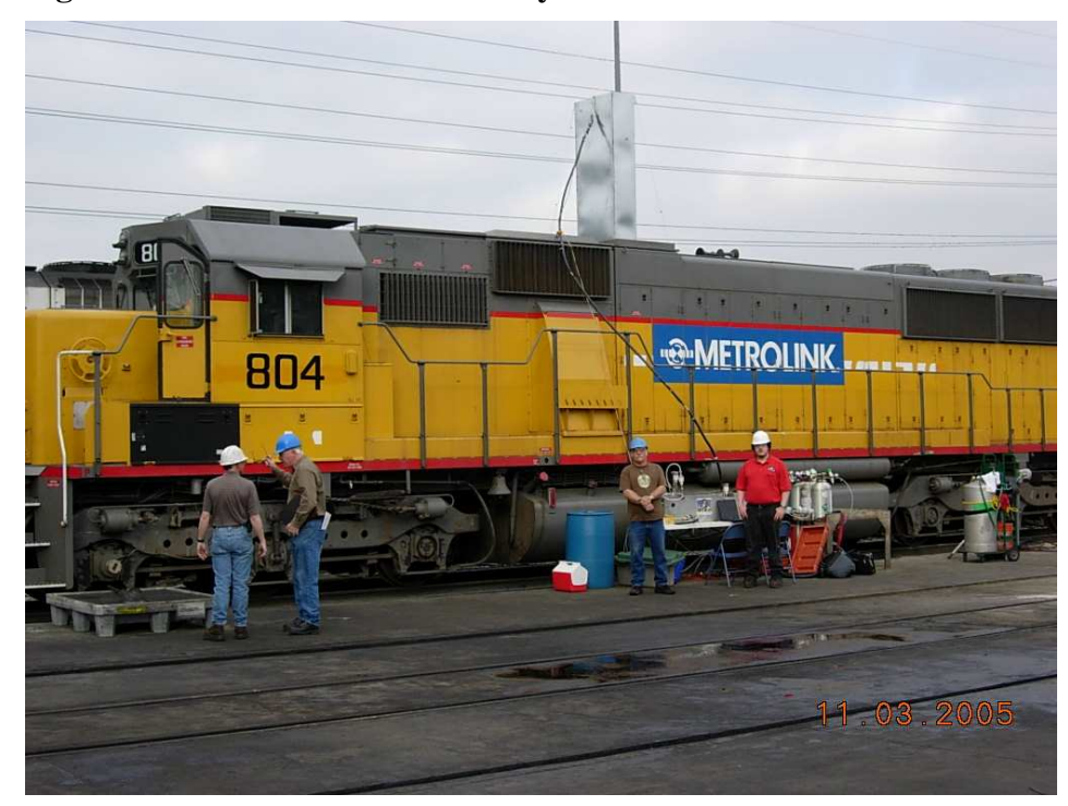
Figure 1: Emission measurement system installation on Metrolink No. 804