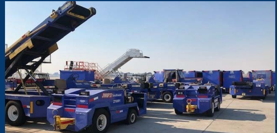
GSE idled due to pandemic reductions in flight operations