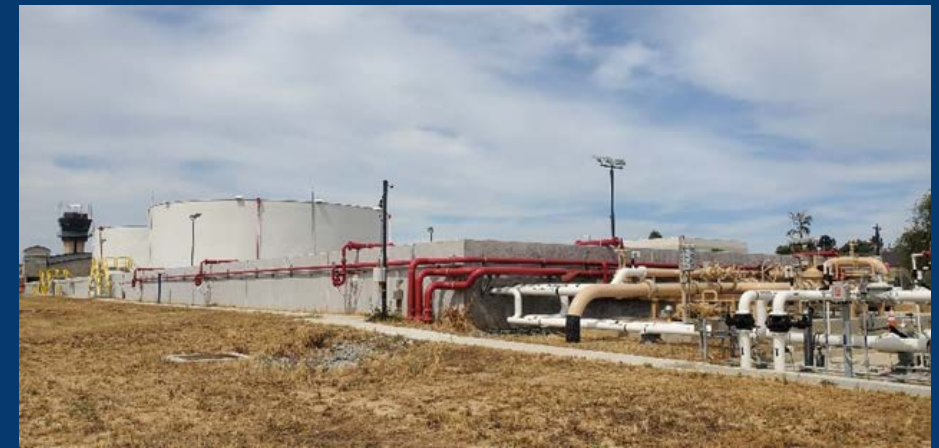
Pipeline and additional 3M gallons storage capacity became operational October 2019