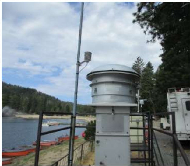
Looking West from the probe.