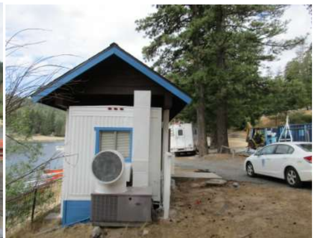
Looking at the probe from the East.