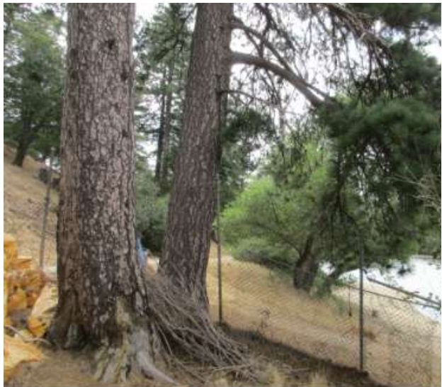
Looking East from the probe.