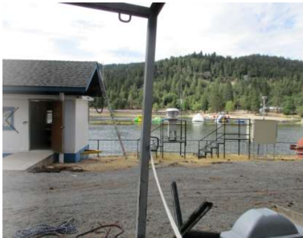
Looking at the probe from the North.