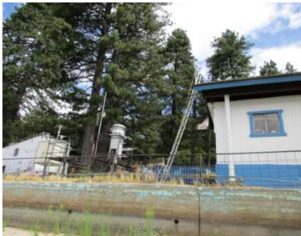
Looking at the probe from the South