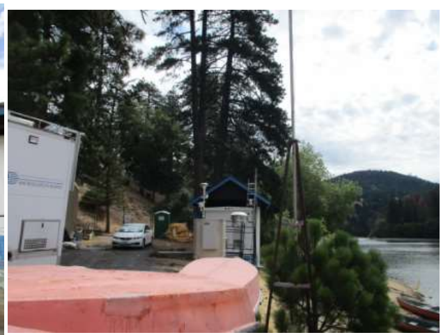
Looking at the probe from the West.