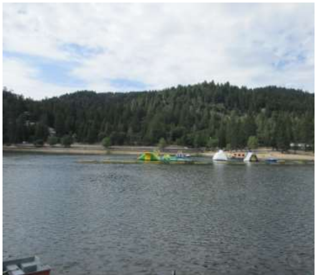
Looking South from the probe.