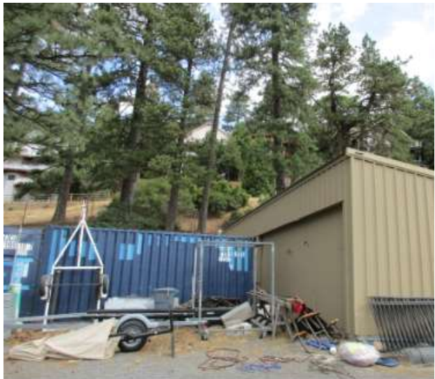
Looking North from the probe.