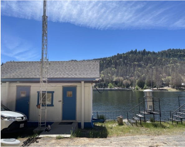
Looking at the probe from the North.