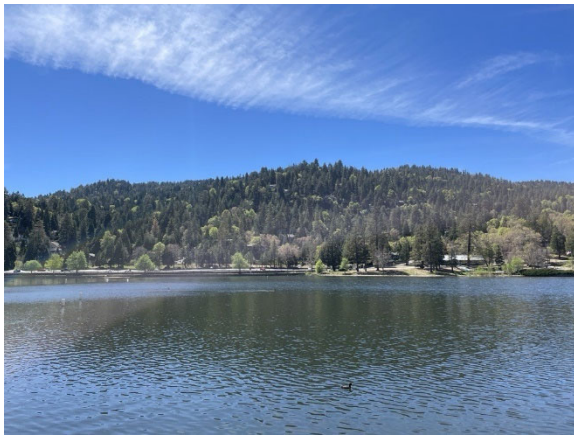
Looking South from the probe.