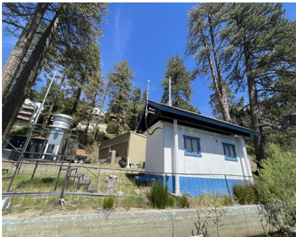
Looking at the probe from the South