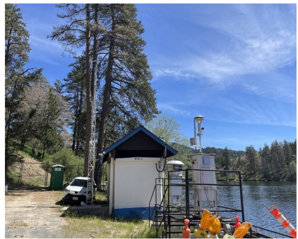
Looking at the probe from the West.