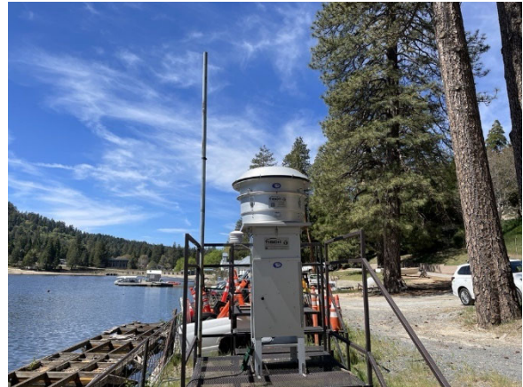
Looking West from the probe.