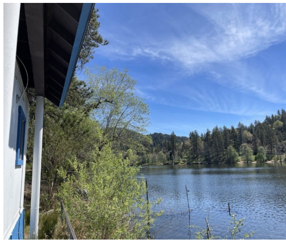
Looking East from the probe.