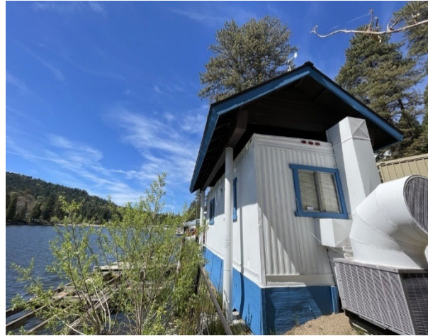
Looking at the probe from the East.