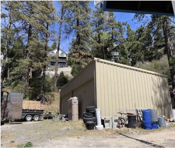
Looking North from the probe.