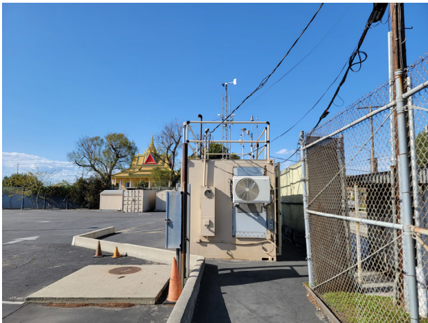
Looking at the probe from the South.