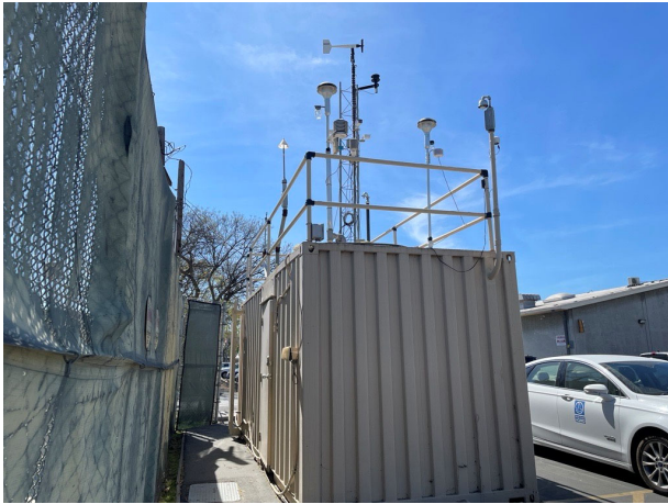
Looking at the probe from the North.