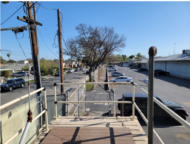
Looking South from the probe.