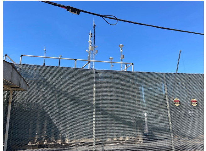
Looking at the probe from the East.