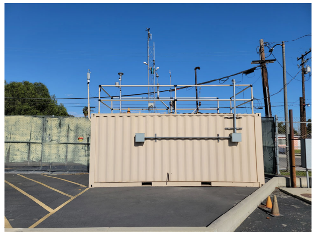
Looking at the probe from the West.