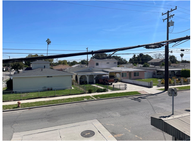
Looking East from the probe.