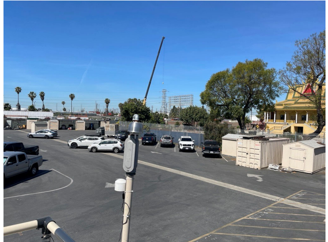
Looking West from the probe.