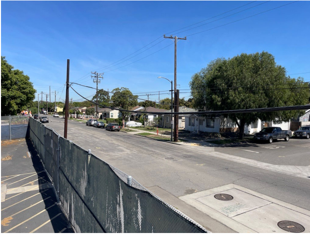
Looking North from the probe.