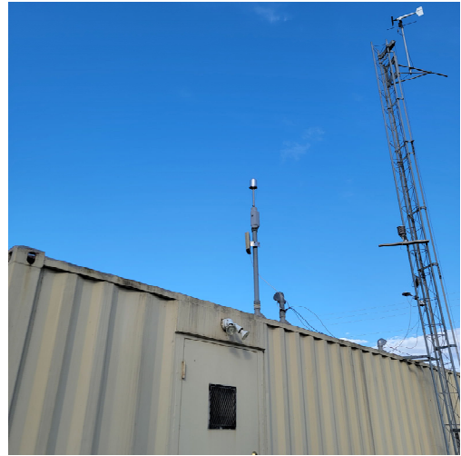
Looking at the probe from the East.