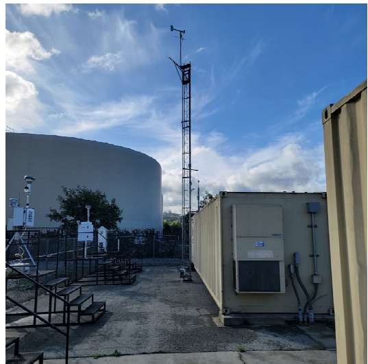
Looking at the probe from the West.