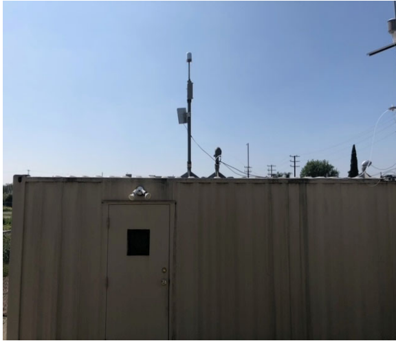
Looking at the probe from the North.