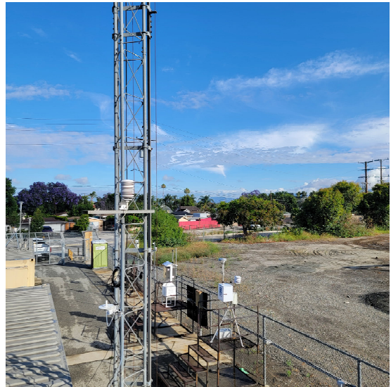
Looking West from the probe.