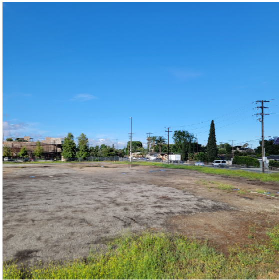
Looking South from the probe.