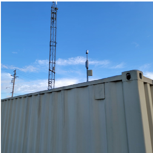
Looking at the probe from the South.