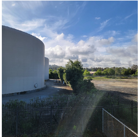
Looking East from the probe.