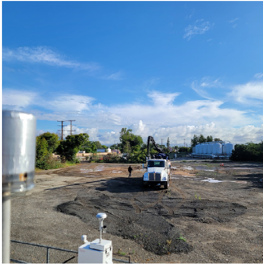
Looking North from the probe.