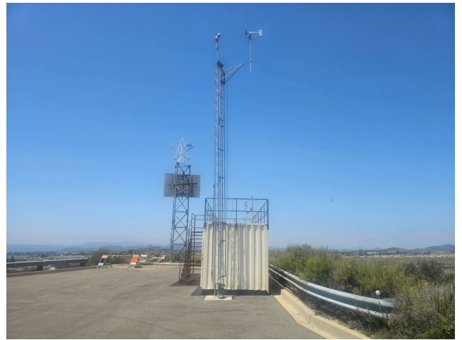
Looking at the probe to the East.