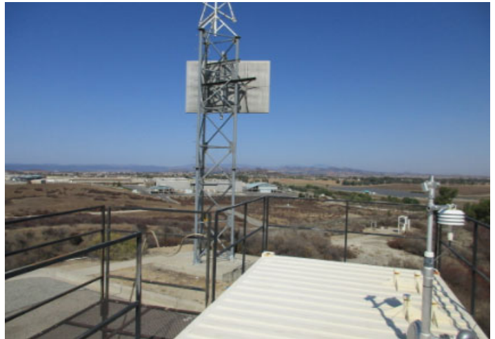
Looking West from the probe.