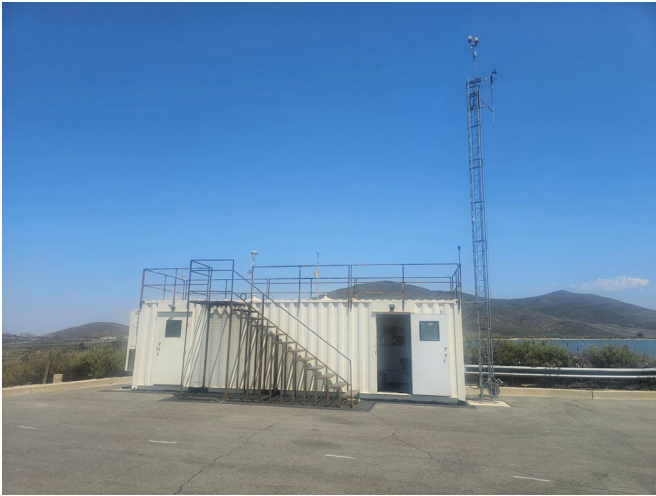
Looking at the probe to the North.