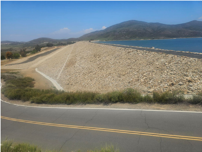
Looking North from probe.