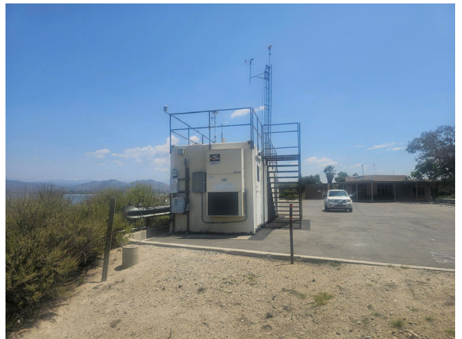
Looking at the probe to the West.