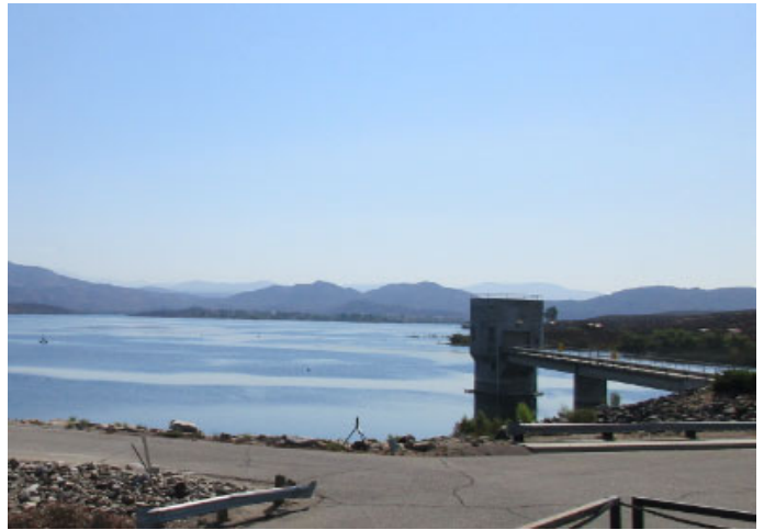
Looking East from the probe.