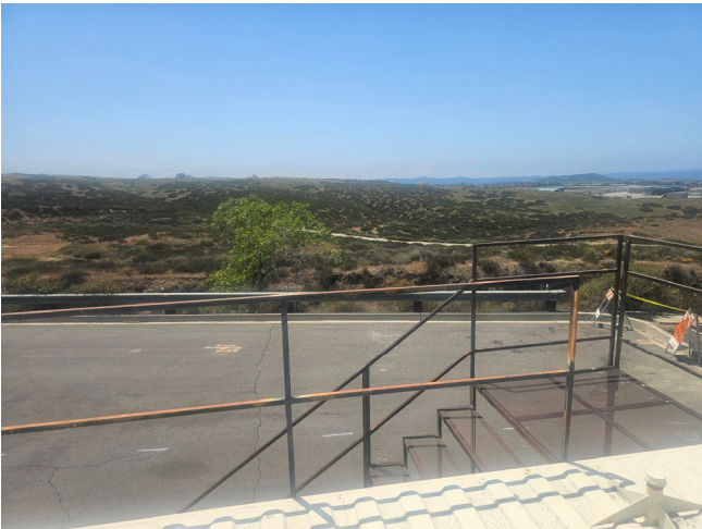
Looking South from the probe.