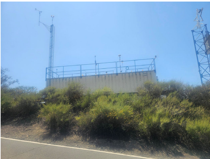
Looking at the probe to the South.