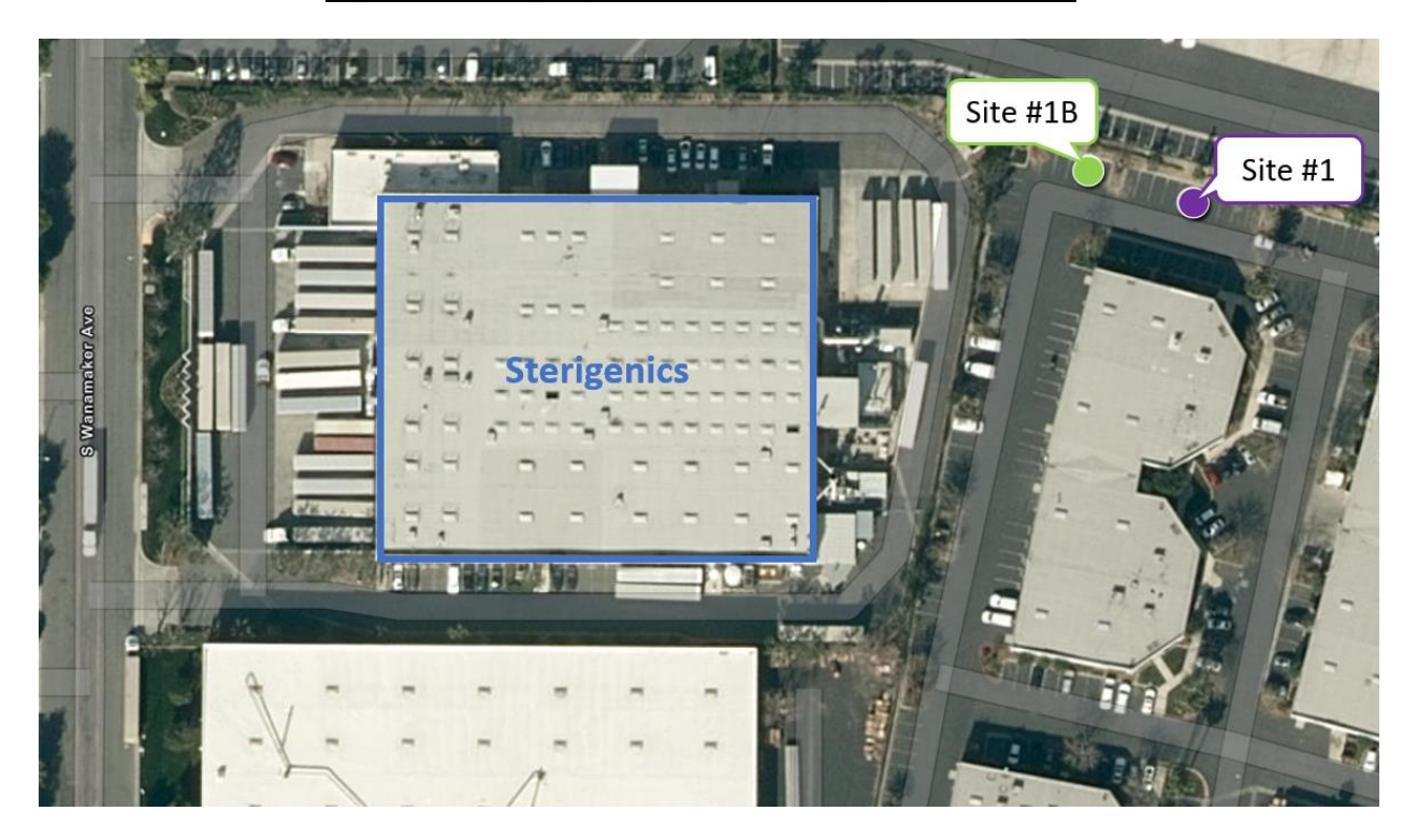
Figure 1 – Sampling Locations near Sterigenics Ontario

South Coast AQMD staff collected 24-hour air monitoring samples near the Sterigenics Ontario facility and detected elevated levels of ethylene oxide at the Ontario Gateway Business Center location (Site #1 and Site #1B). Figure 1 below shows the sampling locations and Table 1 lists the measured concentrations at those locations.