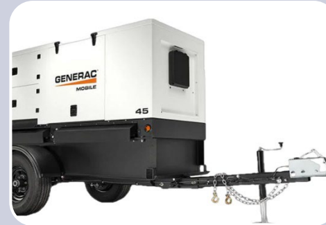
Portable Generator Sets (power generation, fire control)