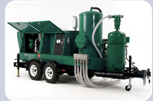
Soil Remediation Equipment