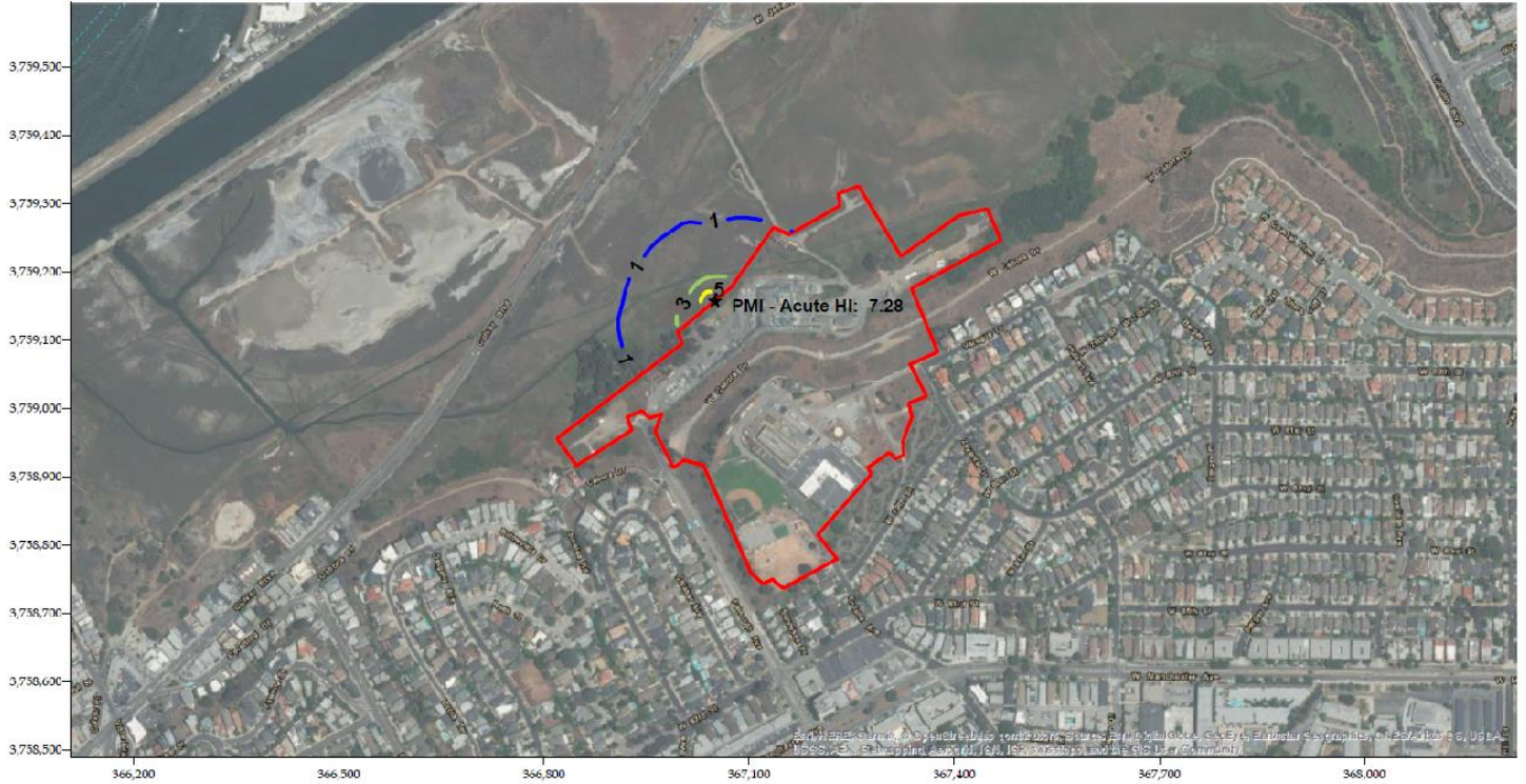
Boundary of So Cal Gas Co., Playa del Rey Storage Facility and Acute Hazard Isoleth