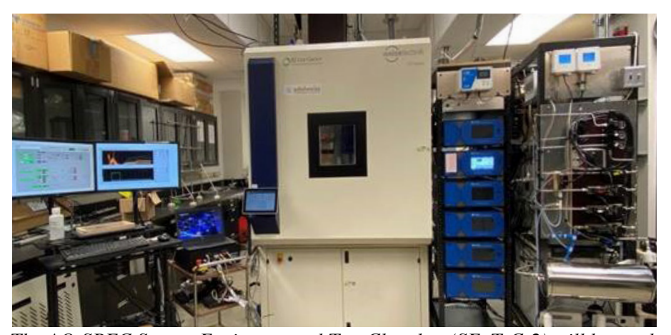
The AQ-SPEC Sensor Environmental Test Chamber (SEnTeC-2) will be used with the ASTM test standards work.

For more information on the ASTM test standards efforts at South Coast AQMD for indoor air quality sensors, visit the AQ-SPEC web page at http://www.aqmd.gov/aq-spec/evaluations/astm-test-standards.