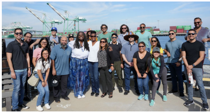
The Diversity, Equity, and Inclusion with Community Air Programs team visit the Wilmington, Carson, West Long Beach Community in September.

The AB 617 Program continues to work toward the improvement of air quality and public health in overburdened, environmental justice communities. The community-based program brings together residents, health and environmental organizations, government agencies, and other stakeholders to form Community Steering Committees (CSCs) to develop and implement plans to help reduce air pollution.