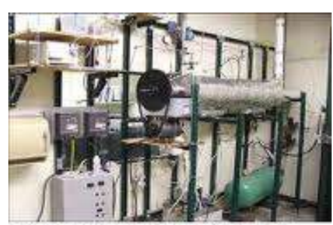
Figure 7 Kiln Seam Hydr ogavification Reacts